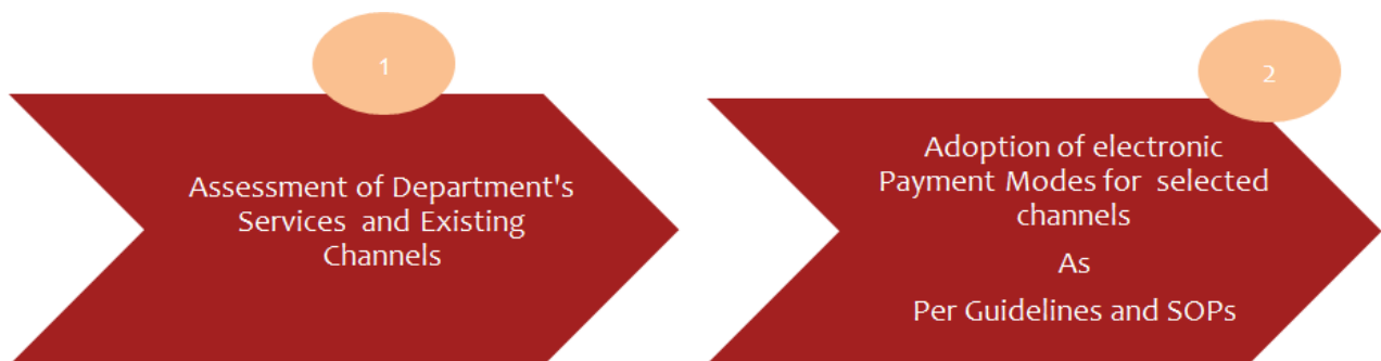
Figure 2: Implementation Approach

The implementation approach for the EPR framework can be defined as a two-step process. It primarily addresses assessment of services offered by the Departments to internal and external stakeholders, identification and adoption of delivery channels and usage of options for electronic payments for payments and receipts from/to department: